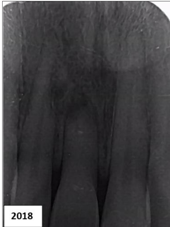
Fig. 8: PA Eight Years after Surgery Year 2018