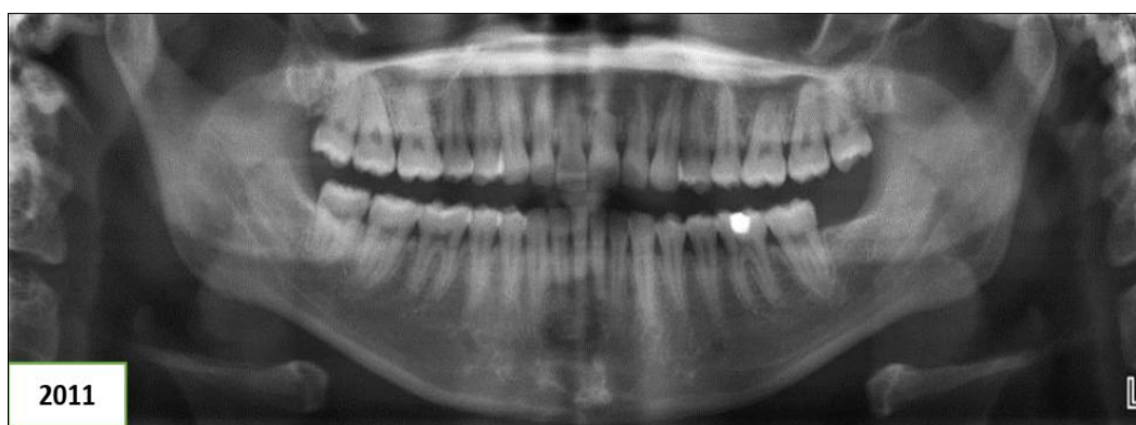
Figure 1: OPG One Year after Surgery Year (2011)

Curettage was performed with resection 90° angle of the apical part of the root, the procedure was successful without any complications. The patient informed to come to the clinic periodically every 6 months for review. At each visit, the patient has been examined clinically and inquired about any signs and symptoms such as pain, swelling, or discomfort, as well as that patient sent for panoramic and periapical x-ray. Unfortunately, the patient was not able to attend as required and she came yearly or after more than one year. The following figures (1-4) presenting the panoramic radiographic and the figures (5-11) shows a periapical radiographic appearance of the tooth 21 and the surrounding structures for twelve years duration after surgery.