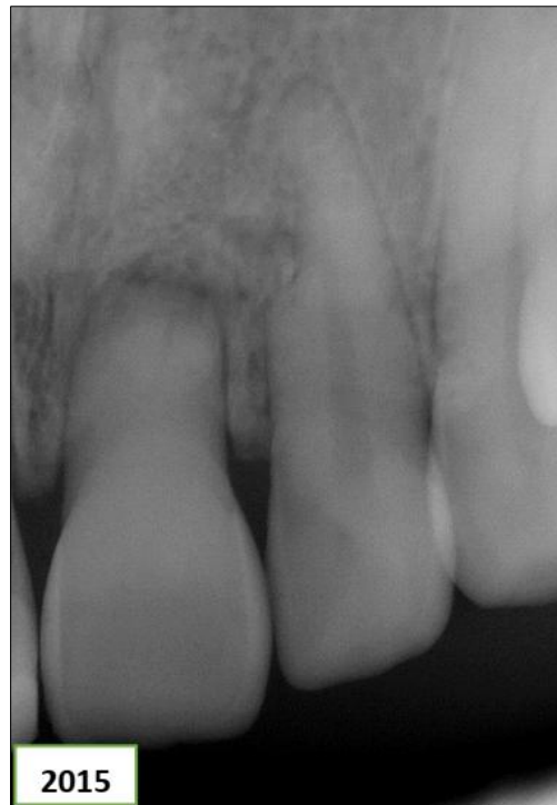
Fig. 6: PA Five Years after Surgery Year 2015