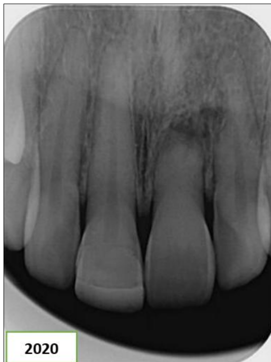
Figure 10: PA Eleven Years after Surgery Year 2020