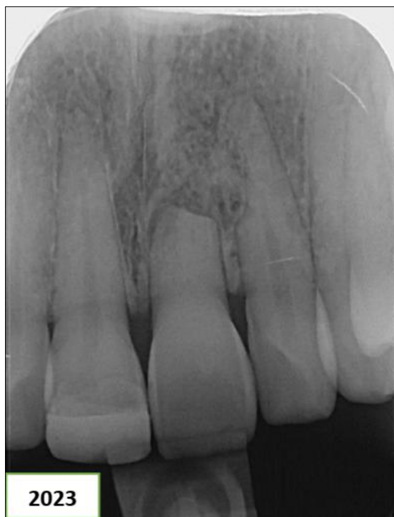
Figure 11: PA Twelve Years after Surgery Year 2023

For the above figure number eleven which is the latest periapical radiograph illustrated, showed a good bone quality at the apical area with no periapical lesion and the root is intact with no remarkable resorption in comparison with the earliest radiographs.