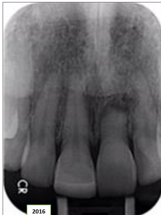
Fig. 7: PA Six Years after Surgery Year 2016