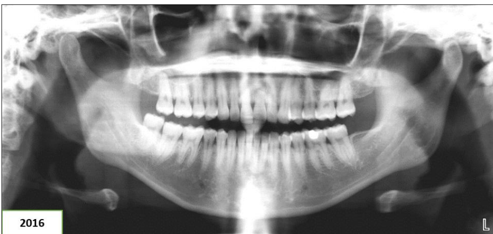
Figure 4: OPG Six Years after Surgery Year (2016)