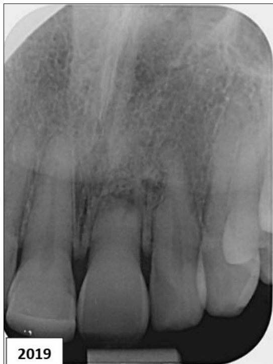
Fig. 9: PA Nine Years after Surgery Year 2019