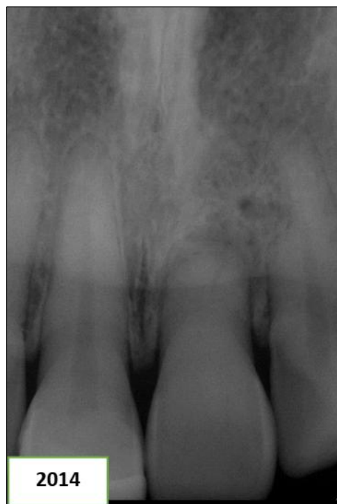
Fig. 5: PA Four Years after Surgery Year 2014