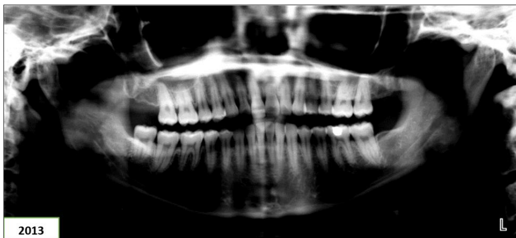
Figure 2: OPG Three Years after Surgery Year (2013)