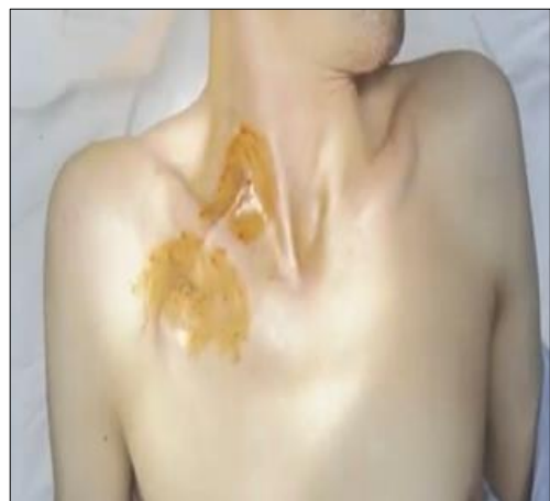
Figure 4: post-operative appearance

An X-ray check in the operating room showing the location of the catheter and the chamber (Figure 5).