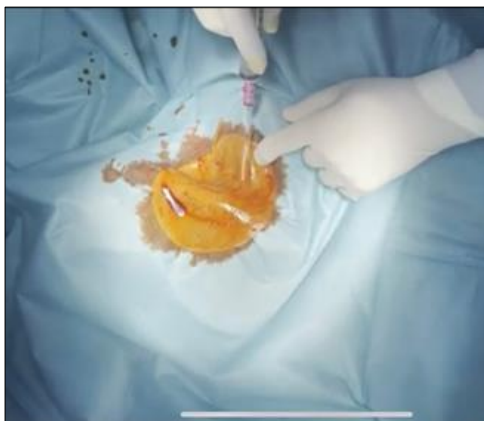
Figure 1 : placement of a central venous line

In our series we opted for the transcutaneous route by puncture of the subclavian vein or the internal jugular vein; the presence of venous blood reflux and good passage after injection were the criteria for the success of the implantation. The device is inserted into the subcutaneous space and attached to a muscular plane. The location of the box depends on the place of insertion of the catheter. Generally it is located under the clavicle and the catheter is introduced into a large vessel so that its distal end is located at the entrance to the right atrium, ideally in the superior vena cava (Figure 1,2,3,4).