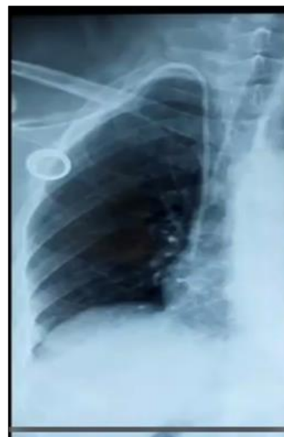
Figure 5: control x-ray

An X-ray check in the operating room showing the location of the catheter and the chamber (Figure 5).