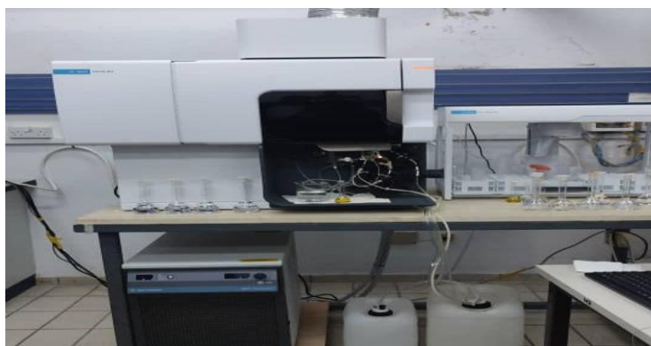
Figure 2.1. ICP-OES device

While the ash values ranged between 9.3 and 12.4 for the white color and 7.3 and 10.9 for the pink color.