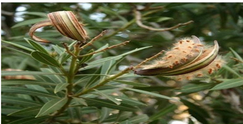
https://invasives.org.za/fact-sheet/oleander/ Figure 2: Nerium oleander (Apocynaceae)