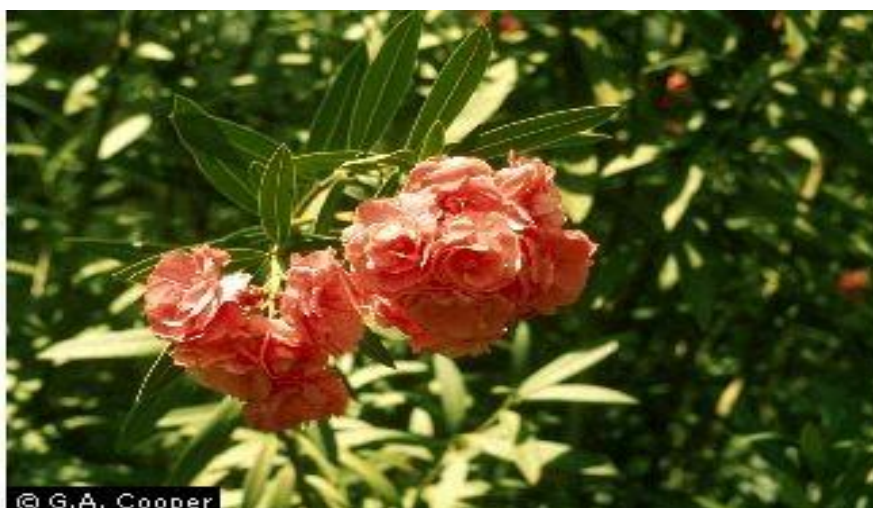
Figure 3: Oleander flowers white and pink

https://plants.usda.gov/home/plantProfile?symbol=NEOL