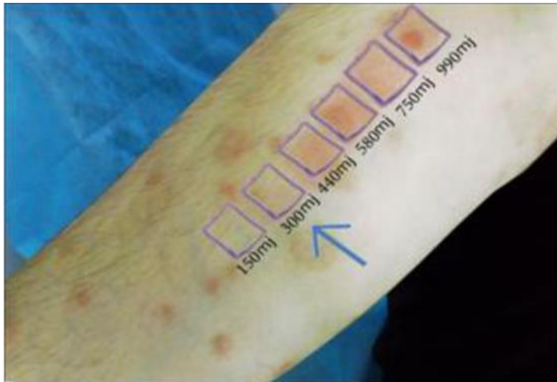
Figure-4: Psoriatic patient with MED to narrow band UVB at 300 mJ/cm 2