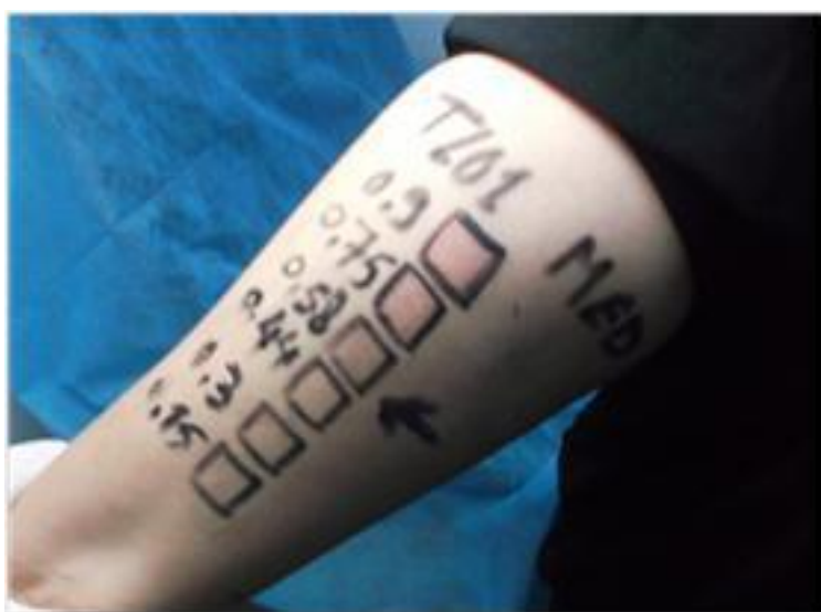
Figure-2: The examination location According to the accompanying table (Table 1), the patient's minimal erythema dose was determined to be 580mJ/cm 2 24 hours later