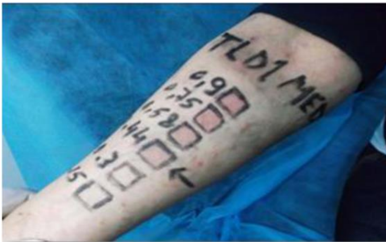
Figure-5: Eczema patient with MED of 440 mJ/cm 2