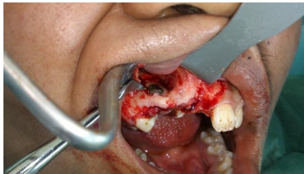
Figure-2: Surgical field

preservation of bone volume, particularly the alveolar process rim as shown in Figure-2, to ensure adequate surrounding support for the transplanted tooth.