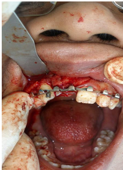
Figure-5: Fixation by using arch bar

The socket was prepared for transplantation to match the length and width of the tooth. The tooth was then carefully inserted into the prepared socket and secured, as shown in Figure-5.