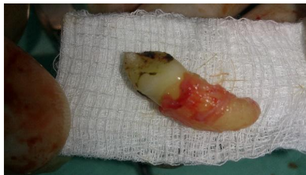
Figure-3: the extracted canine