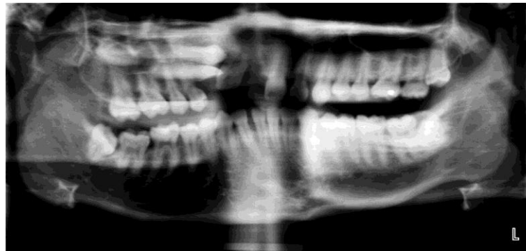
Figure-1: showing the impacted teeth

transplantation. The patient's parent consented to the procedure and was scheduled for the surgical intervention.