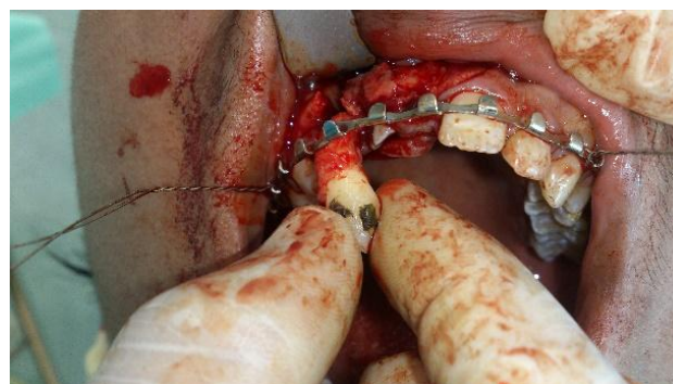
Figure-4: placement the canine in the prepared socket